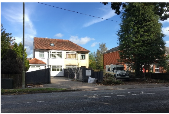
Before and after clearance works secured via a Section 215 Notice in the Borough. In this case the Council took direct action to ensure the Notice was complied with. A legal charge for the costs of these works was then attached to the property